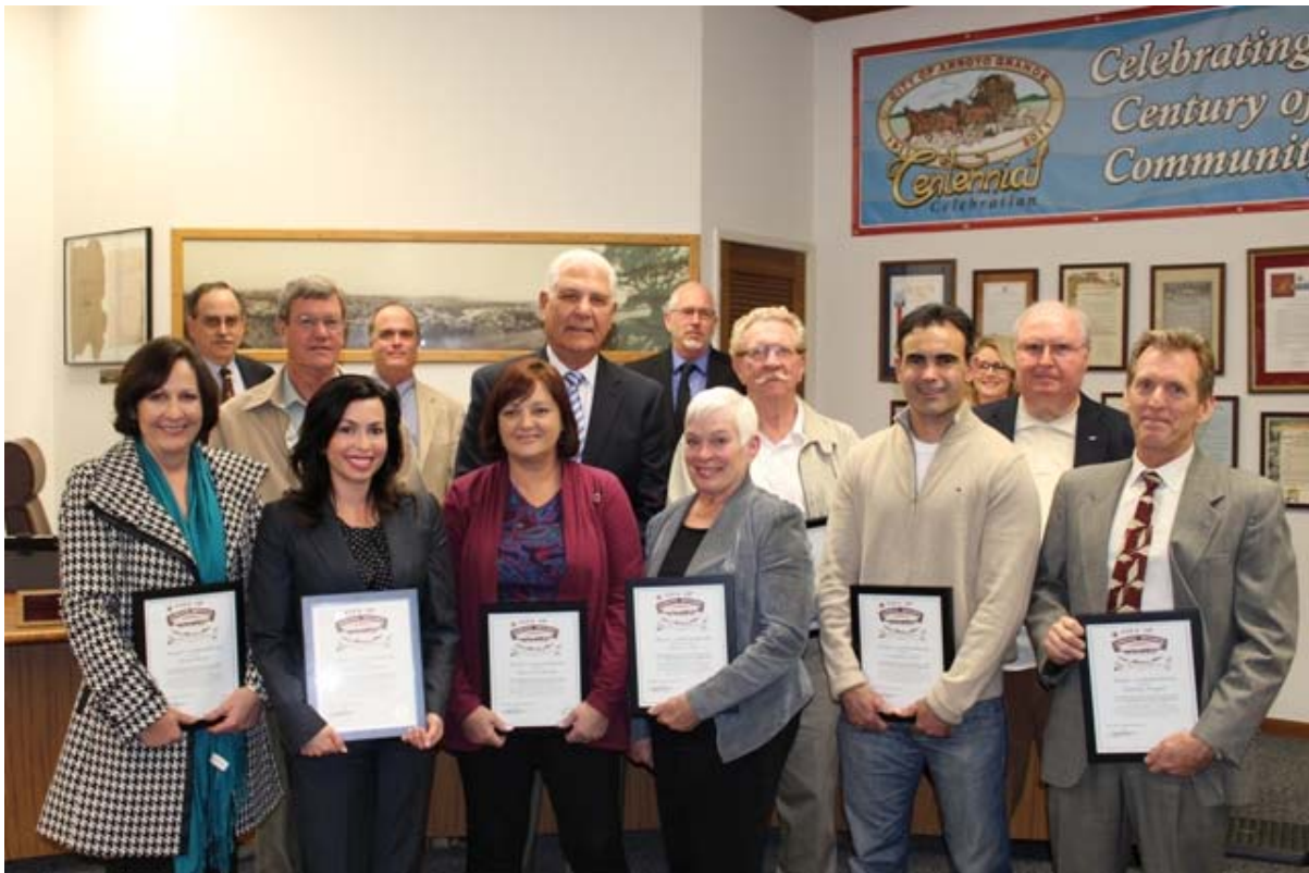
Mayor’s Commendations Presented to AG City Charter Advisory Committee Members