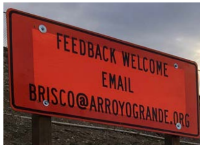
Photo of Feedback Signage at Brisco Road / West Branch Street

The City has established an email address for the users of the Brisco Road area to provide feedback: brisco@arroyogrande.org .